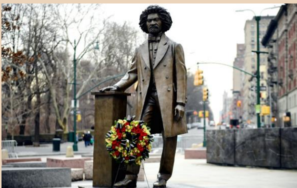
FREDRICK DOUGLASS CIRCLE, NEAR CENTRAL PARK, MANHATTAN