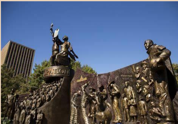
AFRICAN-AMERICAN HISTORY MEMORIAL UNVEILED ON TEXAS CAPITOL GROUNDS

Wolverhampton- https://www.eventbrite.co.uk/e/black-history-month-black-professionals-social-tickets-661974492527