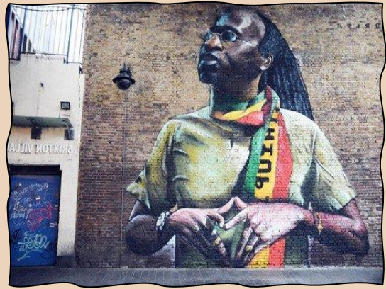
This is a Painting in London, Brixton, embracing the historical Music.

Today, Black History Month is commemorated by communities across the world. Black History Month was first celebrated in the UK in 1987, it is now a month-long, annual celebration of the achievements of Black communities and the remembrance of Black history across the world and takes place throughout October. There are many special ways to participate, including educational events, exhibitions, shows, talks, performances, memorial services and installations across the UK that raise awareness of history and celebrate traditions, customs, and cultures.